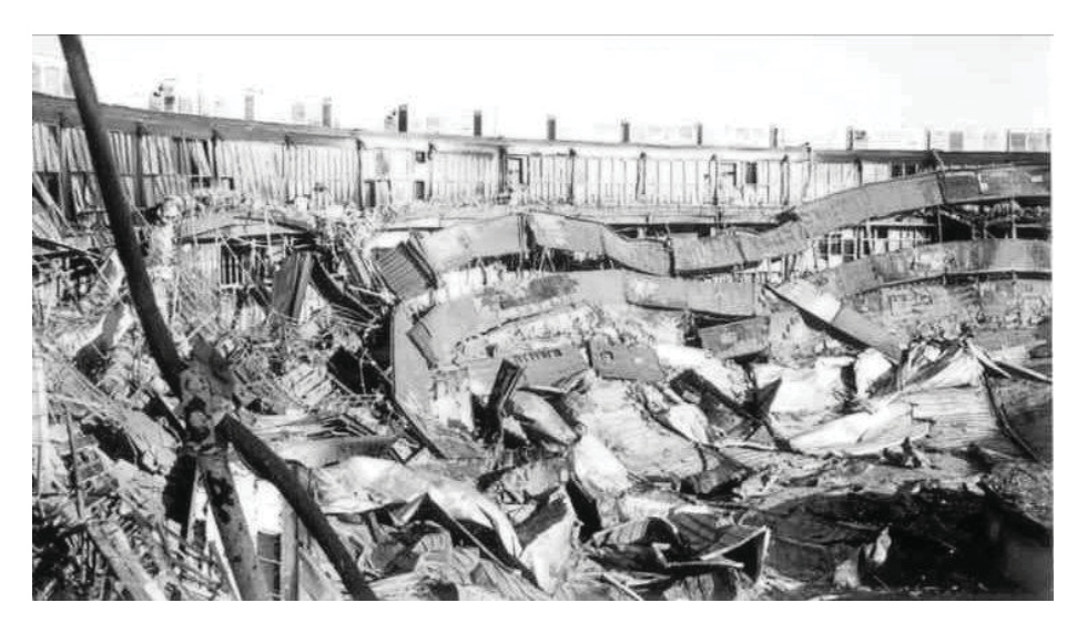
Figure 3.1.4 The structure of the hall after collapse.